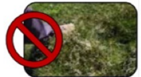
Too Many Seedheads