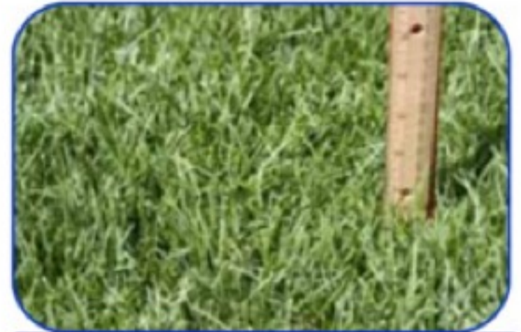
Beautiful turf that requires less mowing, My Holiday Lawn™