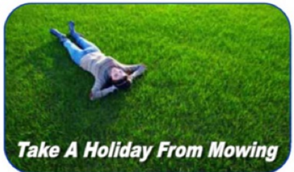
Take A Holiday From Mowing

When My Holiday Lawn™ is mowed, the leaf growth is only partially removed, keeping your lawn looking fresh and green. Not brown and stemmy like ordinary