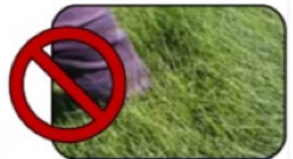
Too Much Top Growth

After decades of breeding for very compact canopy that also upholds the Jacklin reputation for top-quality turf-performance, here comes the revolutionary, My Holiday Lawn™.